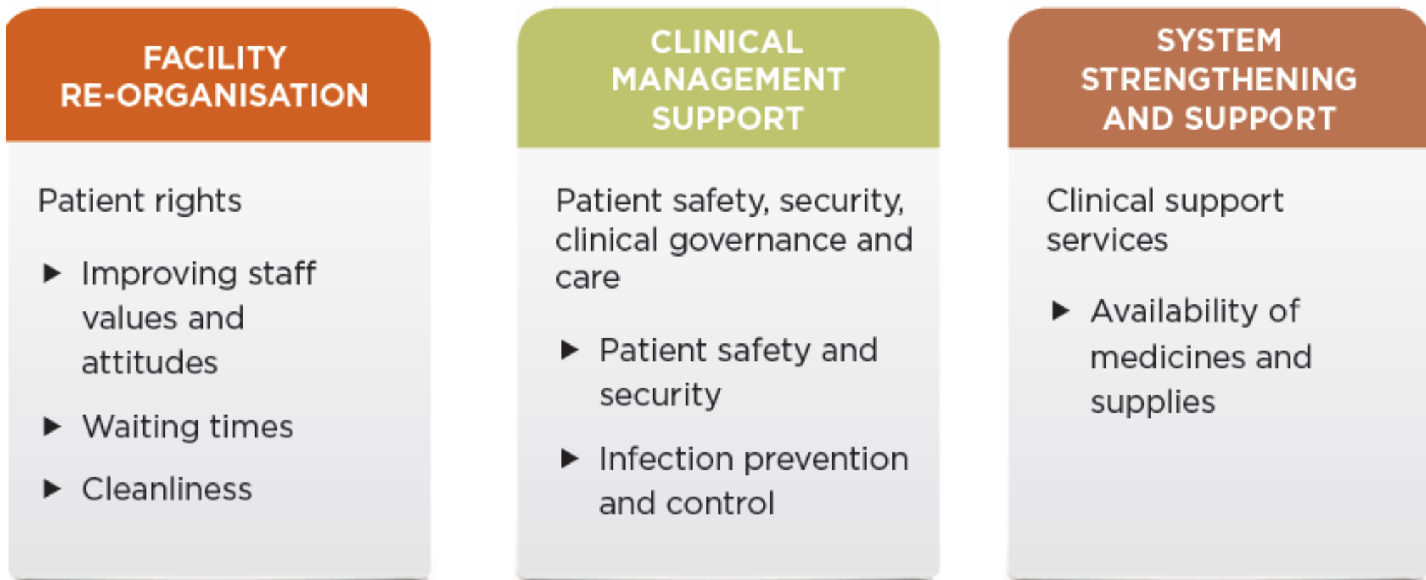
FIGURE 4: LINK BETWEEN ICDM AND SIX PRIORITY AREAS OF THE NATIONAL CORE STANDARDS